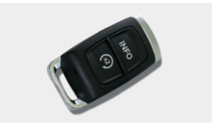
Remote Start (Extended Range Key Fob Shown)††/‡

*6 years/72,000 miles (whichever occurs first) New Vehicle Limited Warranty on MY2018 and newer WW vehicles, excluding e-Golf. See owner's literature or dealer for warranty exclusions and limitations. **Claim based on manufacturers' published data on length and transferability of car and SUV Bumper-to-Bumper/Basic warranty only. Not based on other separate warranties. ¹Genuine Volkswagen Accessories installed by an authorized Volkswagen dealer are covered for the greater of: (1) the accessory limited warranty period (12 months or 12,000 miles, whichever occurs first) from the time of purchase; or (2) the remainder of the New Vehicle Limited Warranty period. Non-genuine Volkswagen Accessories may be covered under separate manufacturer warranties, which can be found at WAccessoriesWarranty.com. Visit WAccessoriesWarranty.com or see participating Volkswagen dealer for complete details. ¹Proper installation required. Professional installation may be recommended. See owner's literature or dealer for details. ¹See vehicle Owner's Manual for further details and important warnings about the keyless ignition feature. Do not leave vehicle unattended with the engine running, particularly in enclosed spaces.