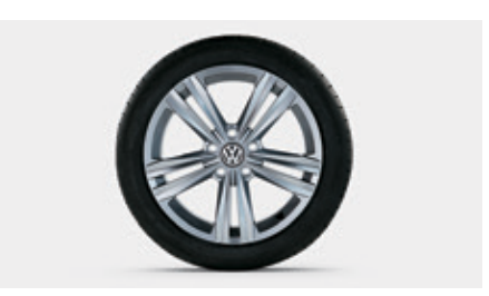
17" Trenton Wheel<sup>††</sup>