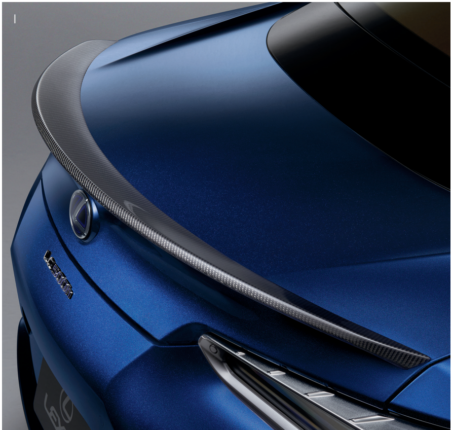
E. Carbon Fiber Lower Grille Insert F. Rear Bumper Appliqué G. Illuminated Door Sills H. Lexus Universal Tablet Holder 3 I. Carbon Fiber Rear Spoiler